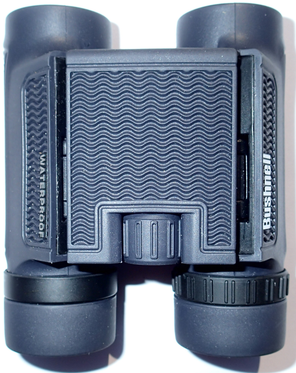
Bushnell H2O compact 10x25 binoculars