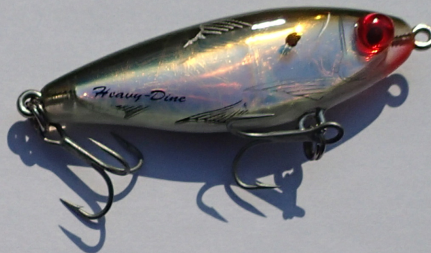
Twitch bait Mirro-lure (sinking)