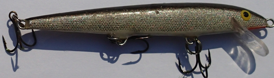
Twitch bait Rapala (floating or sinking)