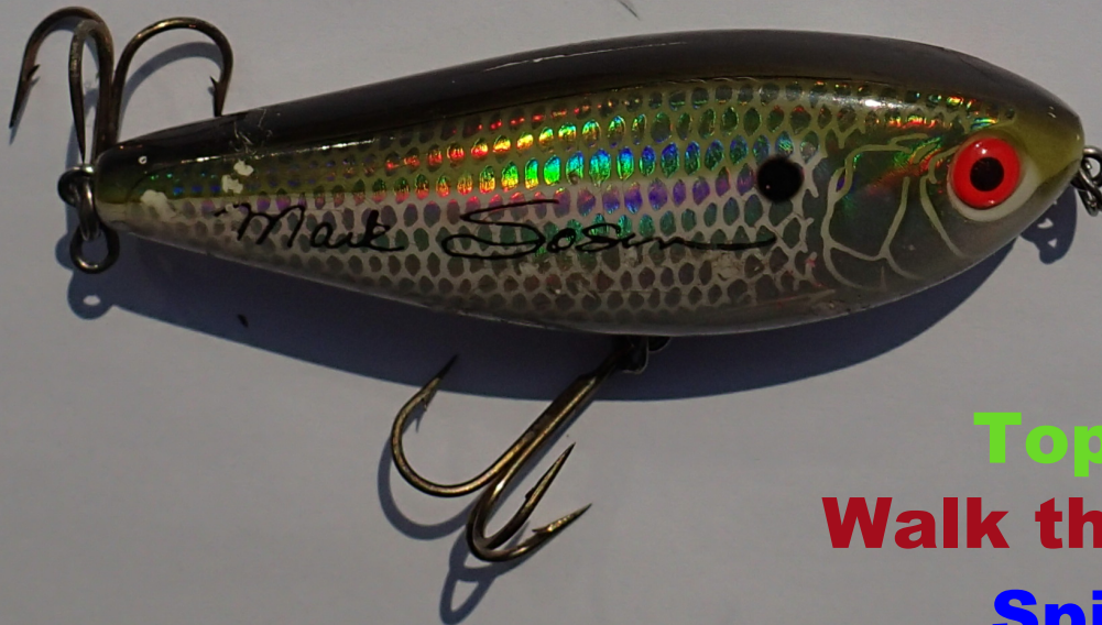
Topwater lure Walk the dog topwater Spittn Image