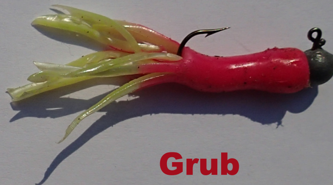
Grub Tube grub