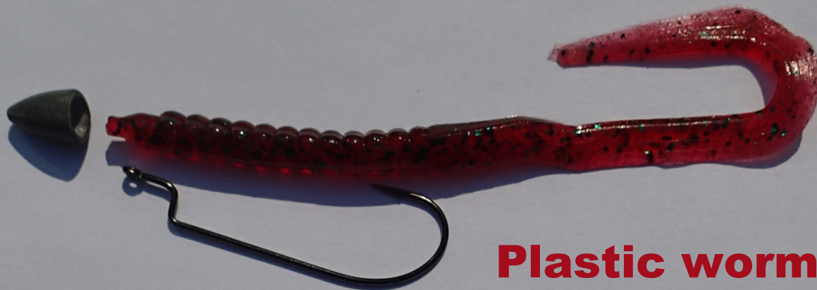
Plastic worm Curly tail (rigged Texas style)