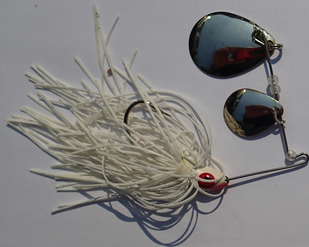
Spinnerbait (with Colorado blades)