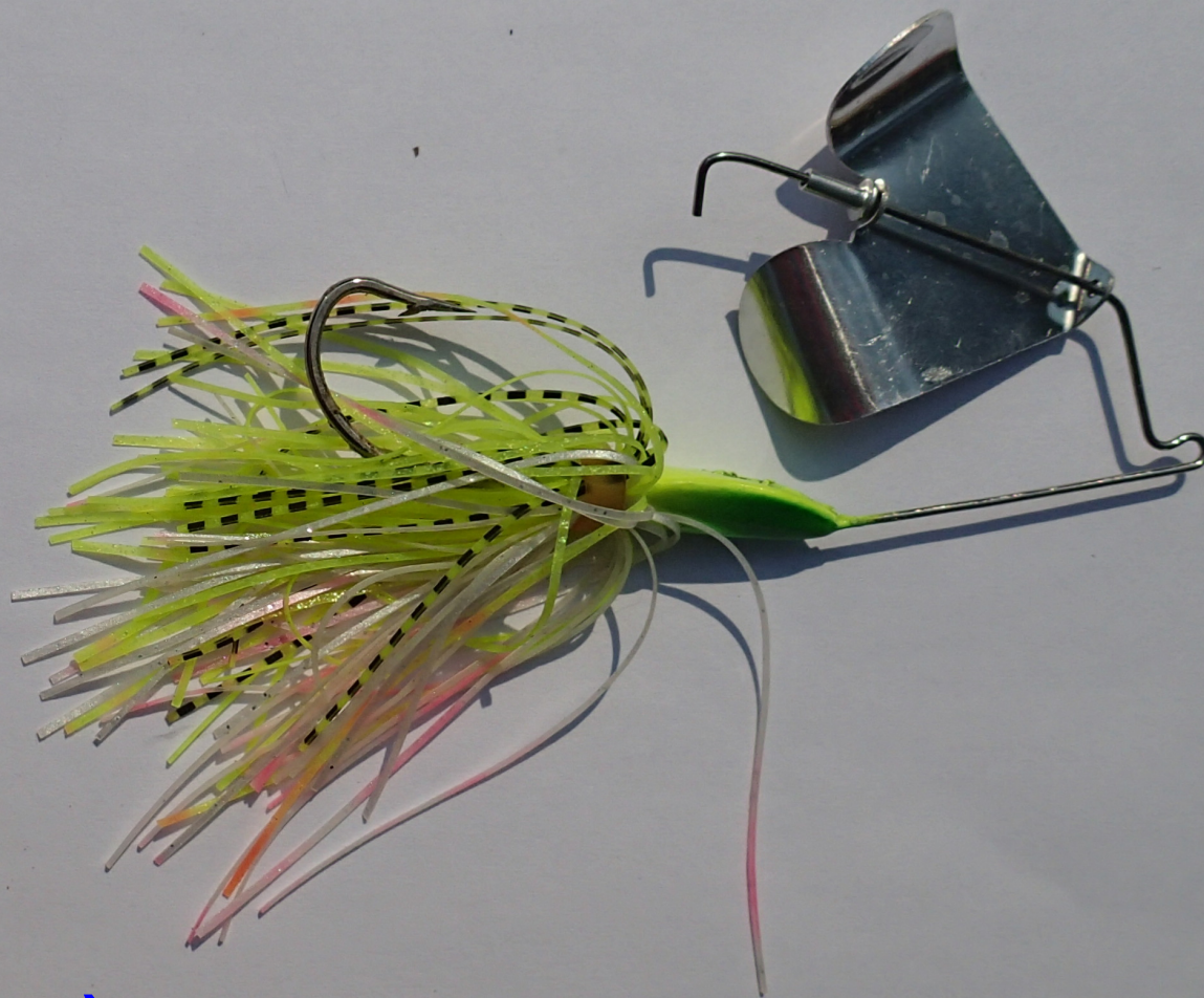
Topwater lure Buzz bait