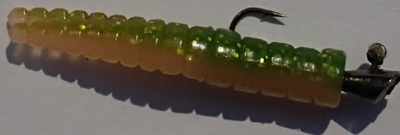
Grub Crappie Magnet