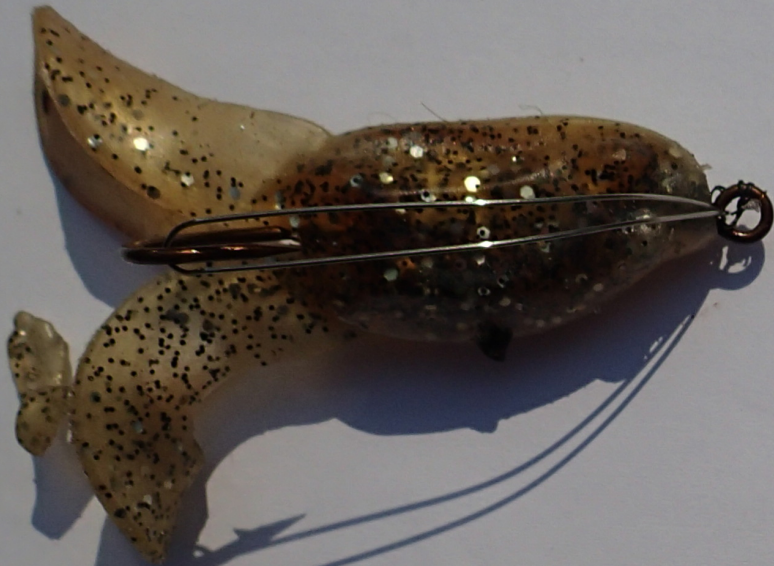
Topwater lure Plastic frog (weedless)