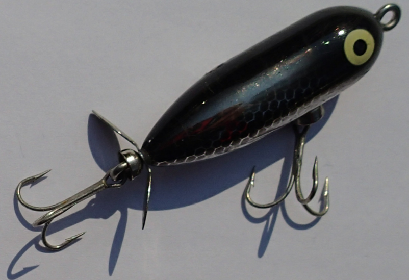
Topwater lure Bladed topwater Tiny Torpedo