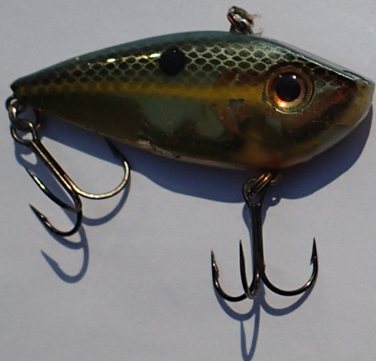
Lipless crankbait Red Eye Shad