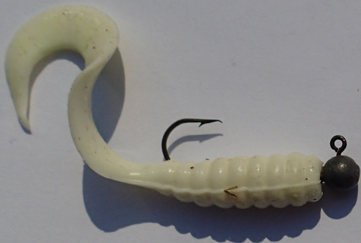
Grub Twister tail grub